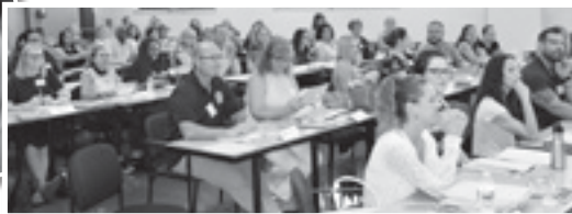
New Hire Orientation 2018