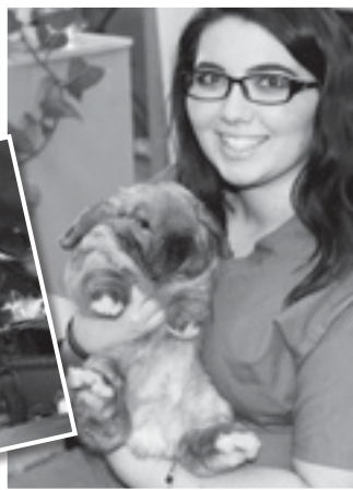
Plant & Animal Sciences