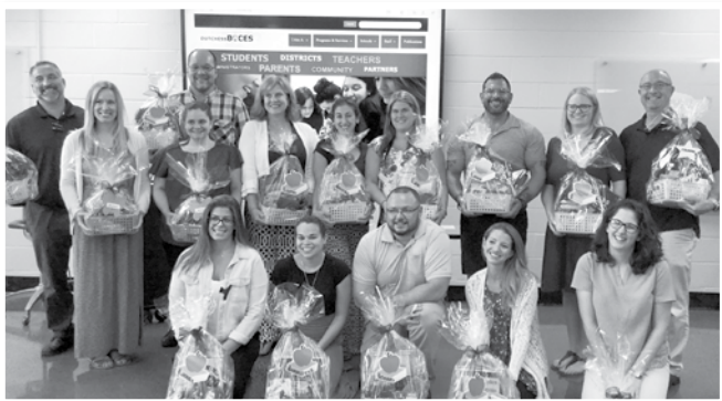
New Teacher Induction 2018

This service assists school districts and parents with all aspects of the home instruction process including: reviewing Individualized Home Instruction Plans (IHIPs), tracking student progress, and assuring compliance with state mandates.